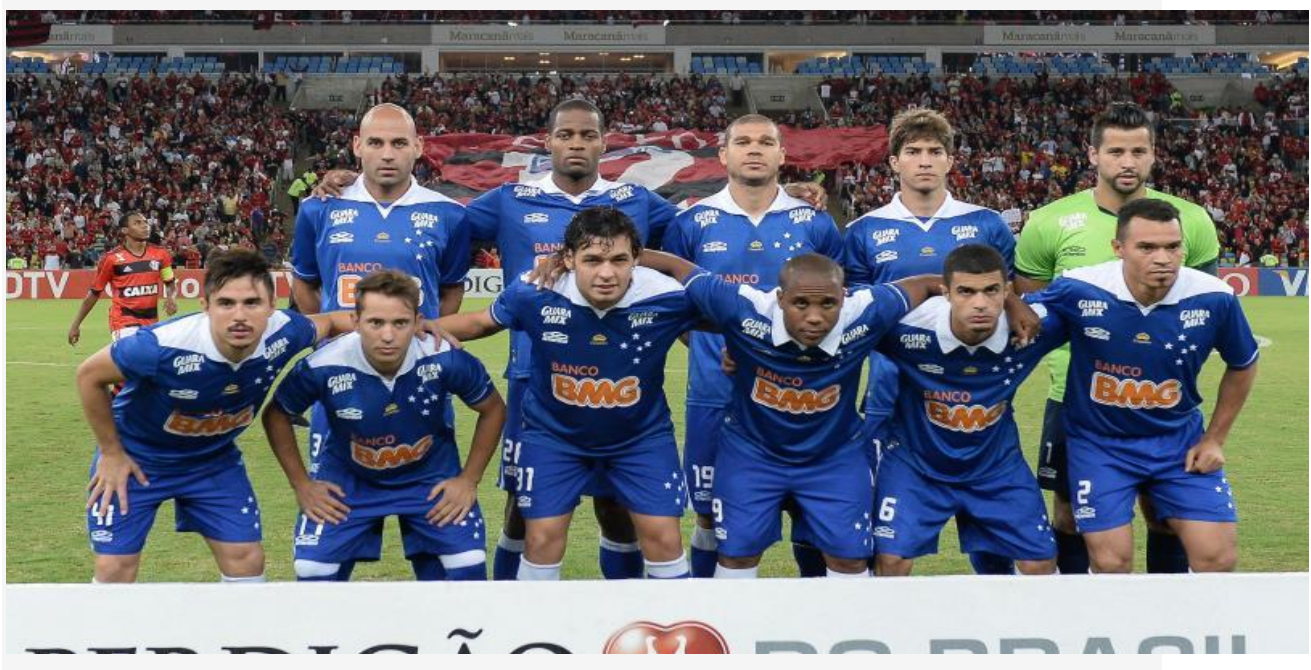
Our 2013 Championship team.