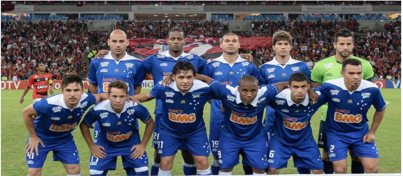
Our 2013 Championship team.