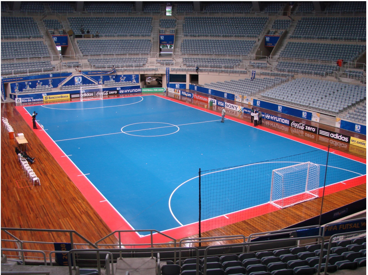
Cruzeiro Futsal Programs (visual of indoor field)